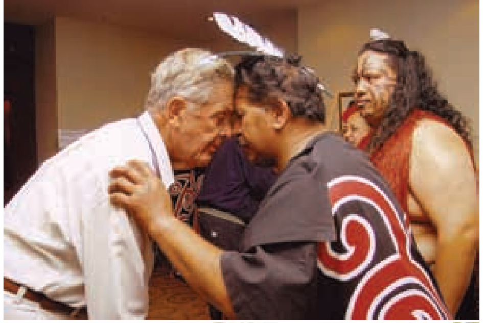
After the Haka, a memorable feature of the Welcome Dinner at Rydge's Hotel